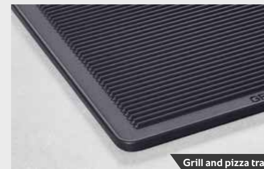
Grill and pizza tray