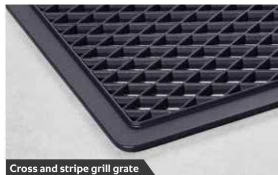
Cross and stripe grill grate

Only by using original RATIONAL accessories can you make full use of the SelfCookingCenter® XS's possibilities. They are extremely rugged and thus ideal for daily, hard use in the professional kitchen. The accessories have been designed for special cooking purposes, such as preparing pre-fried products, or grilling chickens and ducks. Even escalopes and steaks can be prepared without time consuming turning.